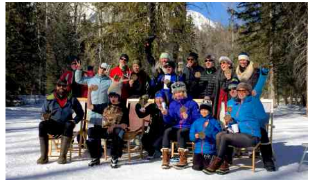
Left: Participants in the Fernie Birkie Right: Several of the participants in the Fernie Birkie