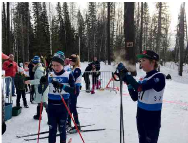
Left and Right: Racers at Teck Kootenay Cup event