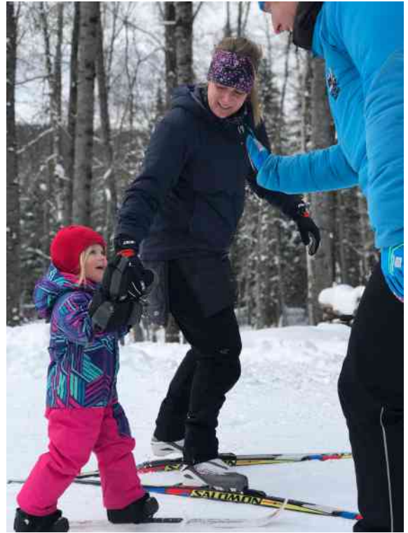
Top and Bottom: Community Fun Race event Right: One team at the Community Fun Race event