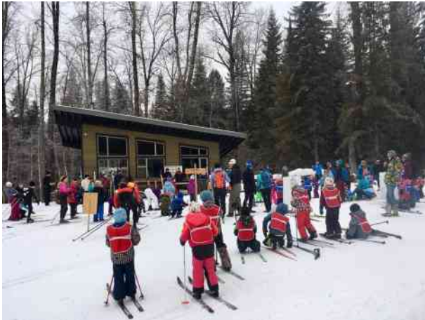
Left: Ski lesson on Saturday morning