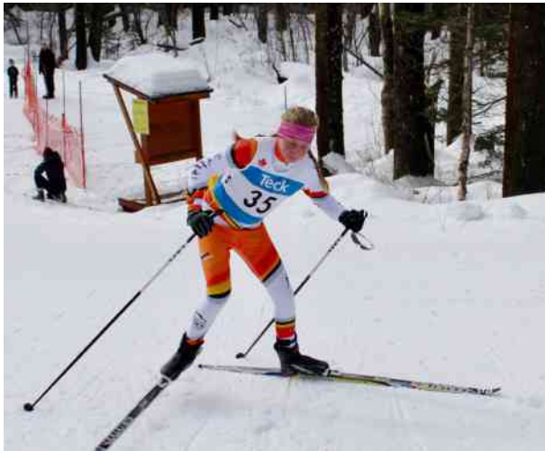
Left: Another racer at Teck Kootenay Cup event