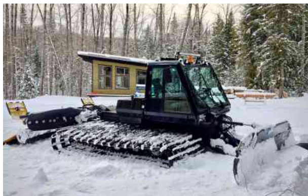
Left: The recently acquired BR-400 groomer