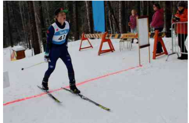
Right: Racer at Teck Kootenay Cup event