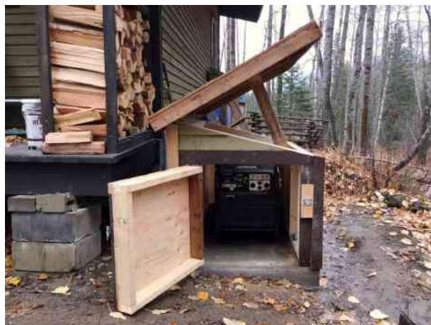
Right: Installation of generator at the warming hut