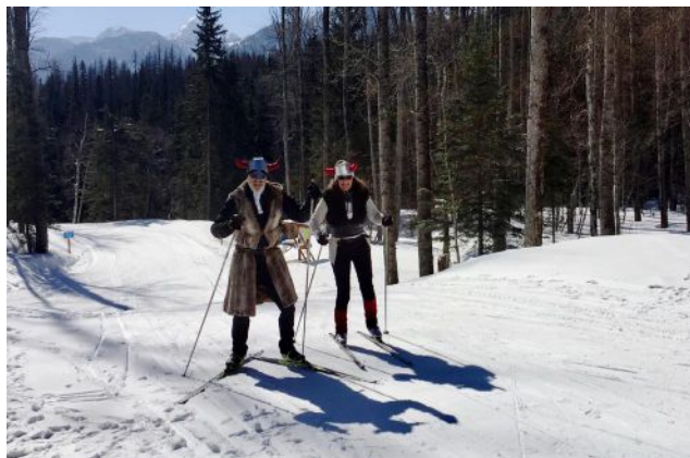
Left & Right: Participants in the 2020 Fernie Flying Viking Challenge