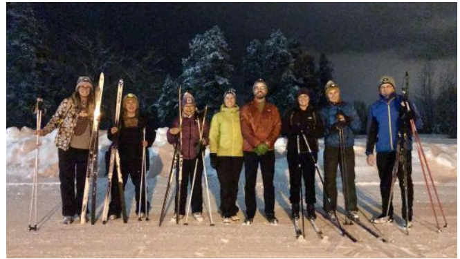
Left: 2020 Community Fun Race – relay race Right: participants at one of the Full Moon Ski events