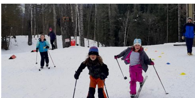
Left: 2020 Community Fun Race – hot chocolate run Right: 2020 Community Fun Race – sprint race